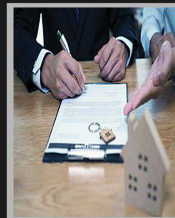
Web & App Development