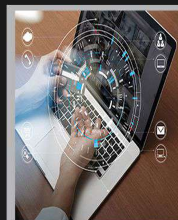
Backend Office Support

Manage real estate investments, provide market insights, and optimizing returns and investor satisfaction.